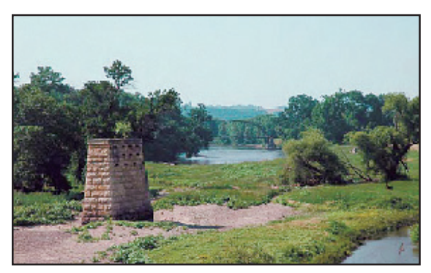
The Big Sioux River valley, outside of Sioux Falls to the east. The City has developed nature parks just to the west of this area as residential areas expand in this direction.